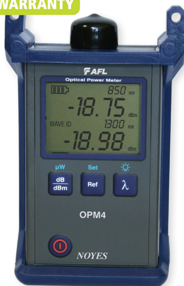
OPM4 Optical Power Meter