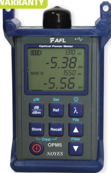
OPM5 Optical Power Meter