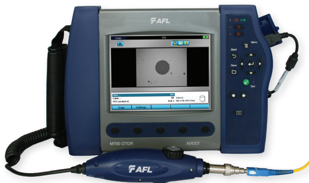
M700 OTDR with DFS1 Digital FiberScope