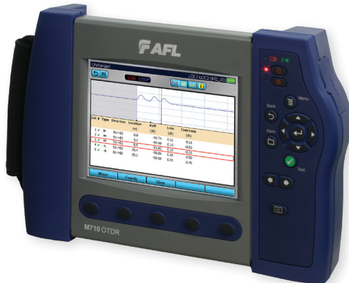
M710 Compact QUAD OTDR